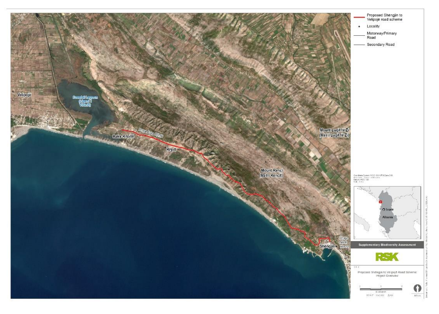
Figure 1-1: Project Location